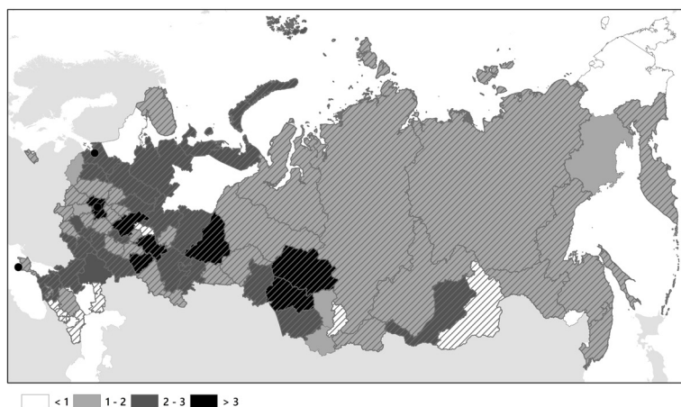
Fig. 3. Share of sales via the Internet in trade, %

The leaders are the same rich northern regions and the largest agglomerations in which residents are willing to pay extra for such services. In Moscow and the Moscow region, the value of this indicator is above 60 %, which can be explained by the high level of income, and the wide distribution of such services due to the competition of businesses. In Kabardino-Balkaria, the value is below 22 % due to poor infrastructure development, a high proportion of rural residents in remote mountain settlements, and the spread of shadow businesses that are not interested in using digital technologies, including Internet banking. Online delivery is less developed in most regions of the North Caucasus, in many regions with a large proportion of the elderly population (Ryazan, Oryol, Lipetsk, and Ulyanovsk regions), inland territories having low household income, and in remote settlements located far from large markets (Tyva, Khakassia, and the Krasnoyarsk krai). An unexpectedly low rate is observed in the Primorsky krai, where the price of the Internet is relatively high (Fig. 3).