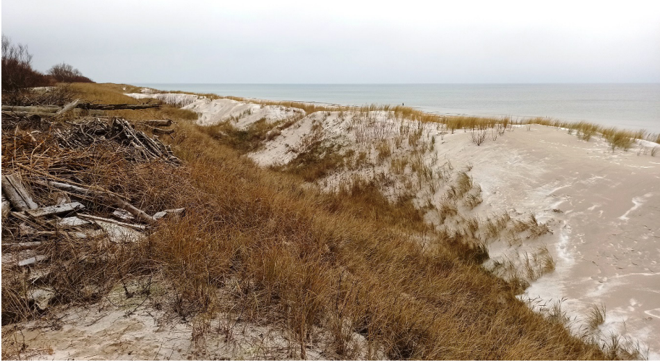
Fig. 2. Shallow deflation basin.

Trail planning. At the next stage, the trail is planned taking into account the location of the target objects, as well as environmental requirements. If it is possible to use different modes of transportation, the trails for each of them are specified.