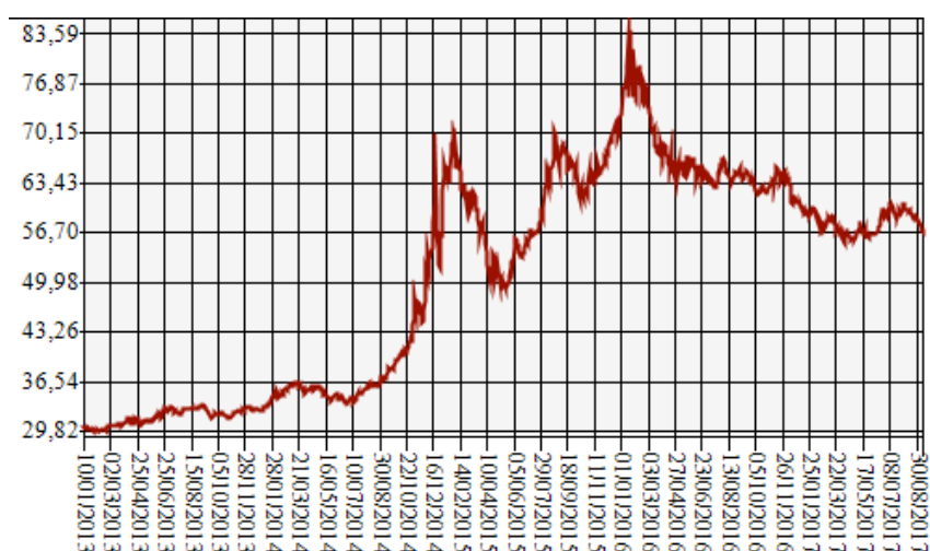
Fig. 2. The value of the Russian Rouble against the US dollar since the beginning of 2013 3