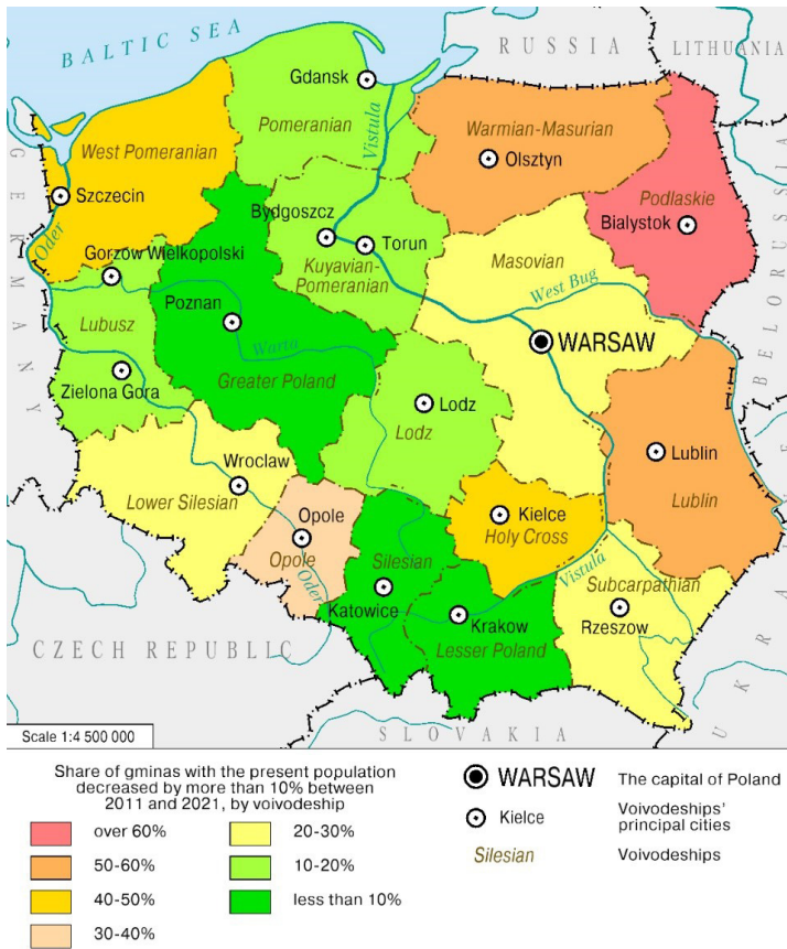
Fig. 3: Proportion of gminas with a decrease in resident population by more than 10% in 2011 – 2021, by voivodeship

Compiled from: Ludność rezydująca – informacja o wynikach Narodowego Spisu Powszechnego Ludności i Mieszkań, 2022 , Warszawa: Główny Urząd Statystyczny, URL: https://stat.gov.pl/obszary-tematyczne/ludnosc/ludnosc/ludnosc-rezydujaca-dane-nsp-2021,44,1.html (accessed 14.02.2023).