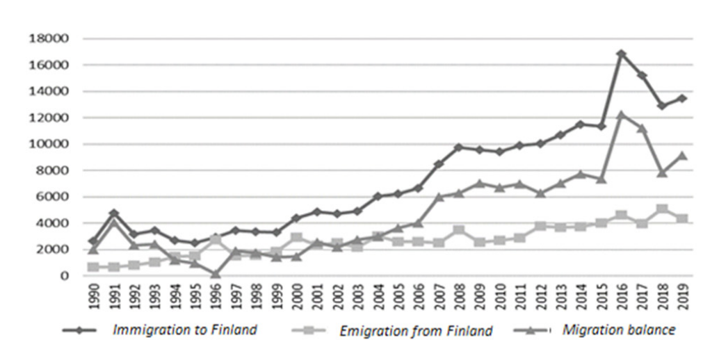
Fig. 1. Migration between Finland and non-EU countries, 1990—2019, people